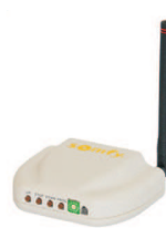
Universal RTS Interface 16 Channel