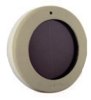
Sunis WireFree™ RTS Outdoor Sun Sensor

Visit www.somfy.com/oximo for additional information.