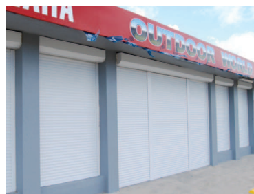
Commercial Store Fronts