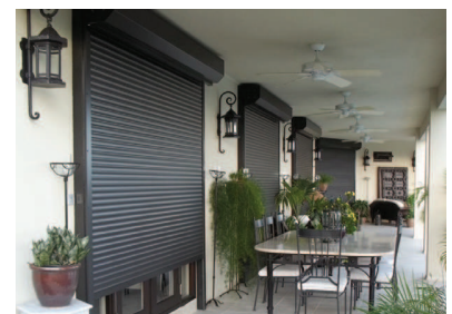
Security, Energy Savings and Hurricane Protection